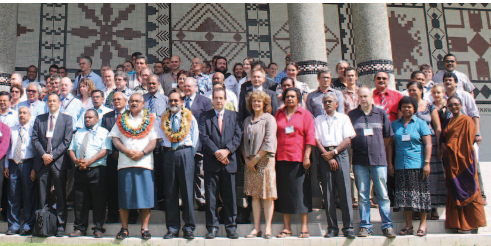
PACE-Net Key Stakeholder Conference, Suva, 12-14 March 2013

Conference which also further stimulated initiatives for research collaborations.